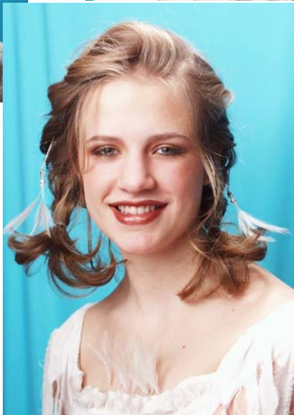
Leave some hair out in the back