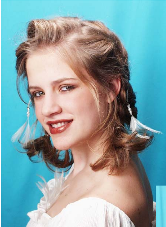
The hair ornaments are actually earrings that I hooked into the hair.