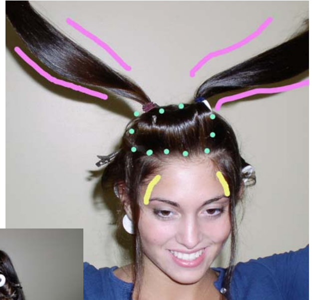
Two ponytails allows for better balance when making the curls for the finished look.

C. This shot below is showing the tendrils in yellow, the top front roller in green and now you will see the ponytails have been curled with a hot curling iron shown in pink.